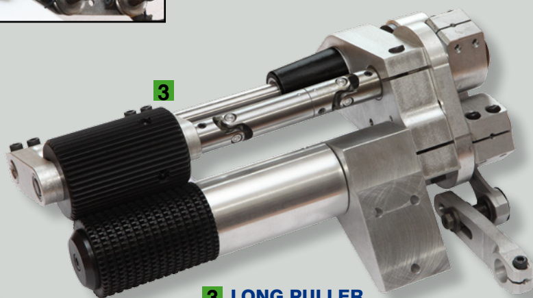
3 LONG PULLER Detail - for 2600S